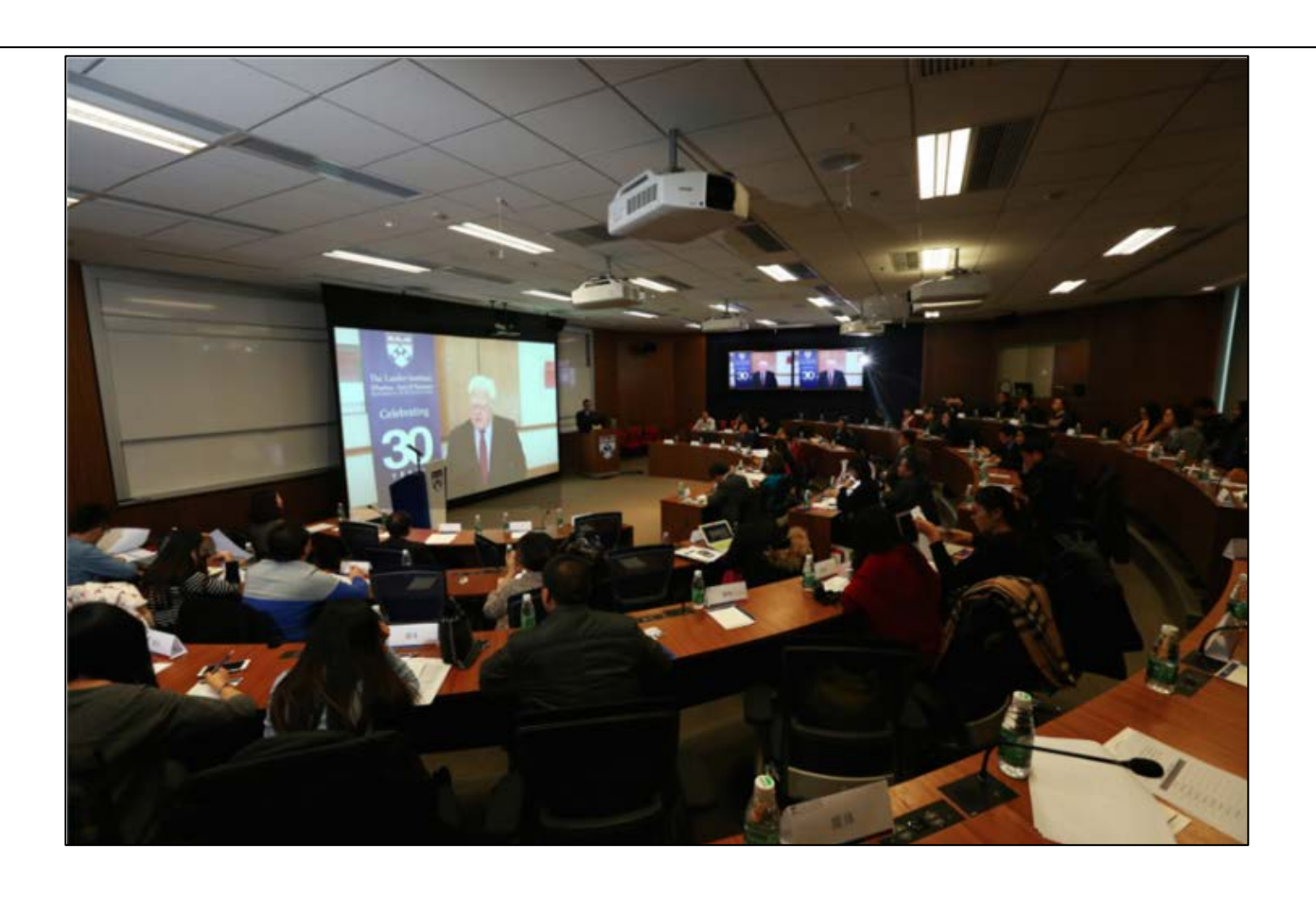
Center for China and Globalization. Beijing, China. 27 January 2016.