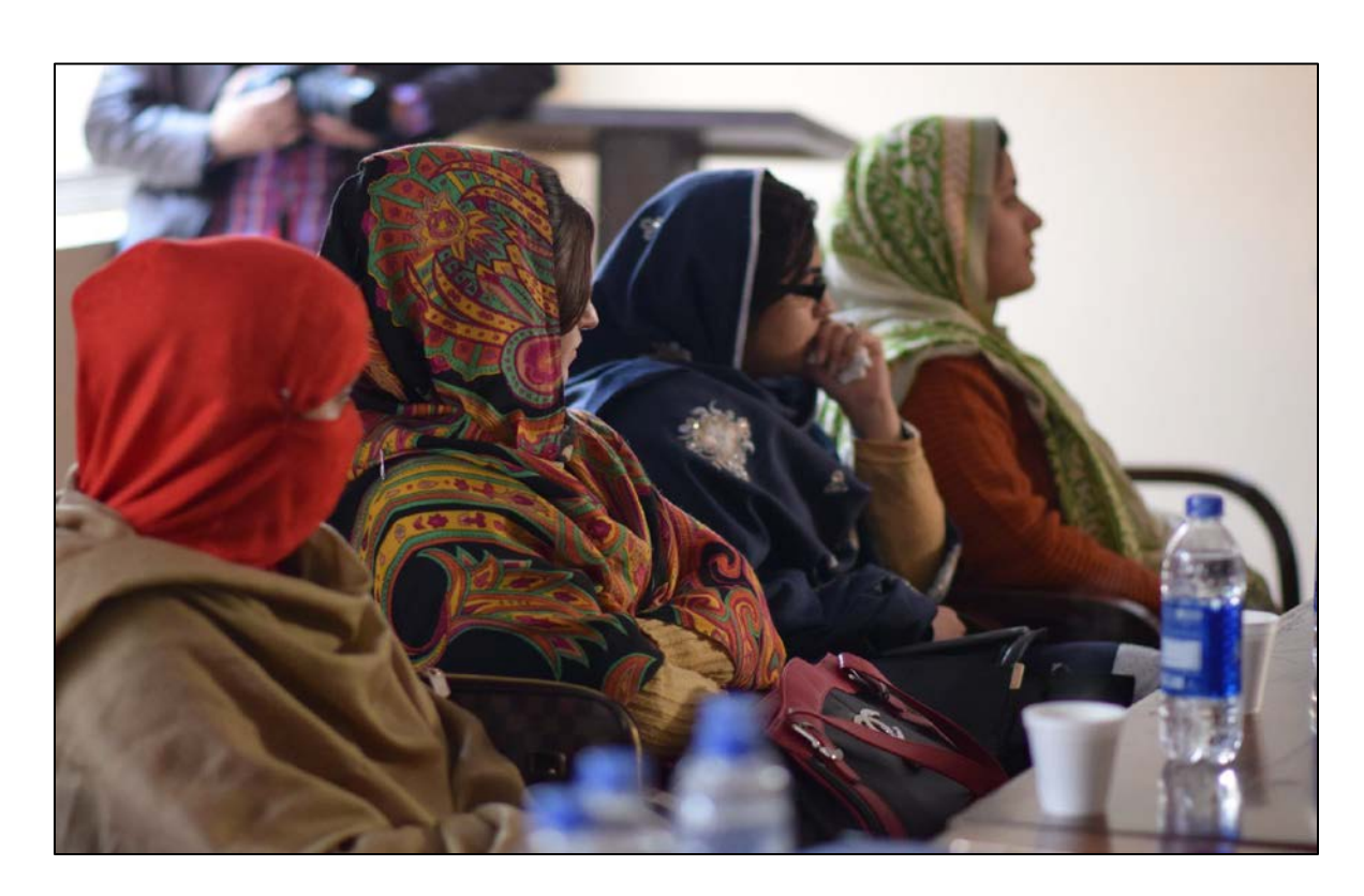
Alternate Solutions. Peshawar, Pakistan. 27 January 2016.