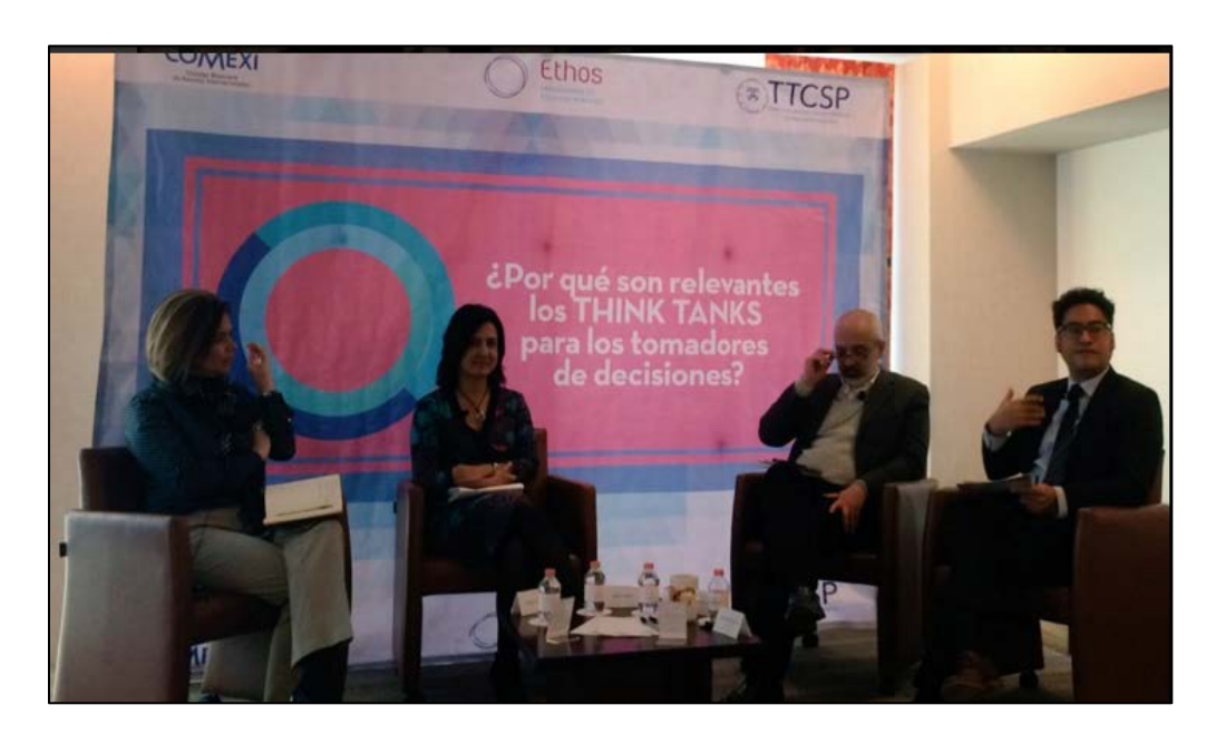
COMEXI and Ethos. Mexico City, Mexico. 27 January 2016.