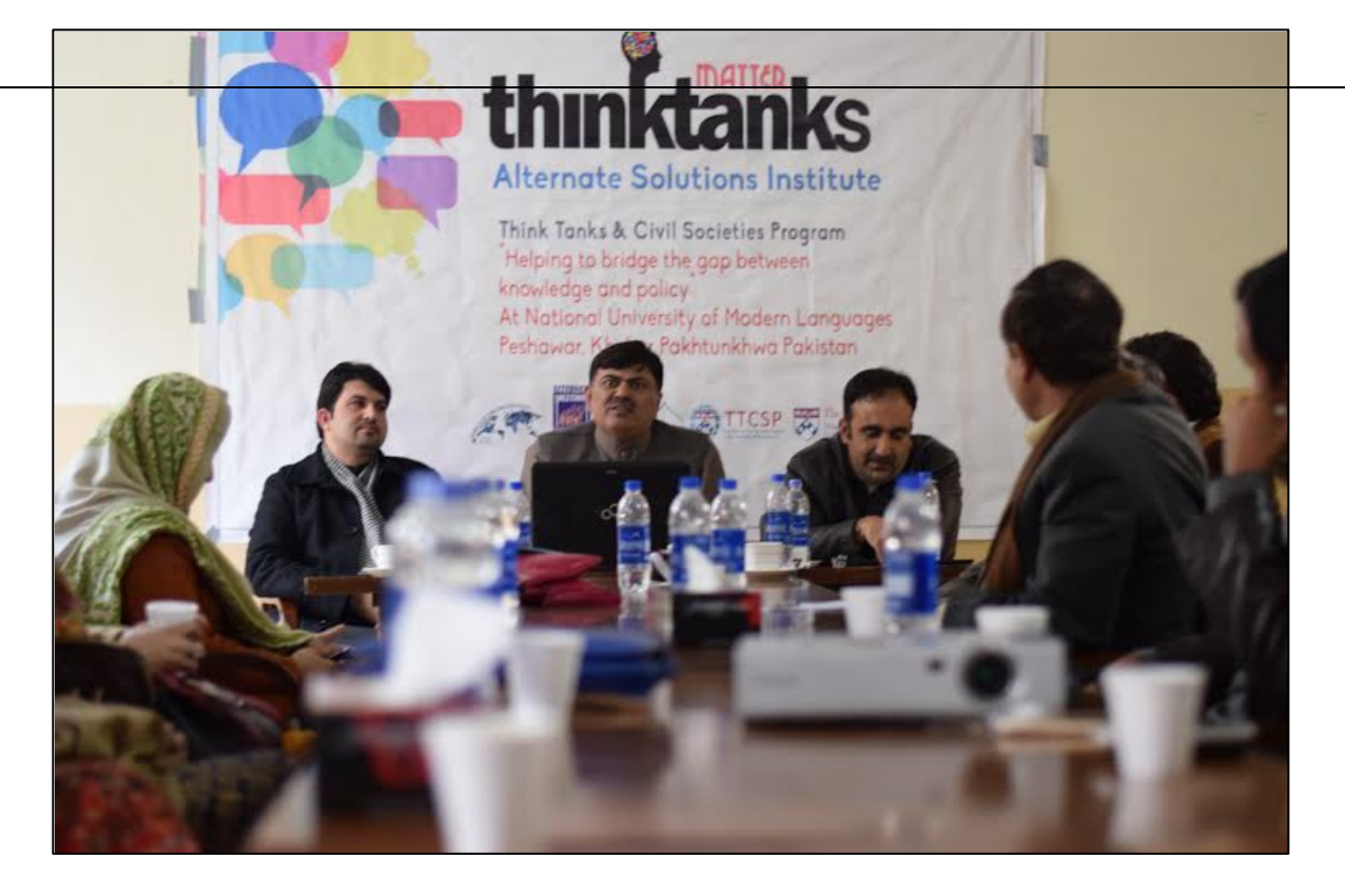
Alternate Solutions. Peshawar, Pakistan. 27 January 2016.