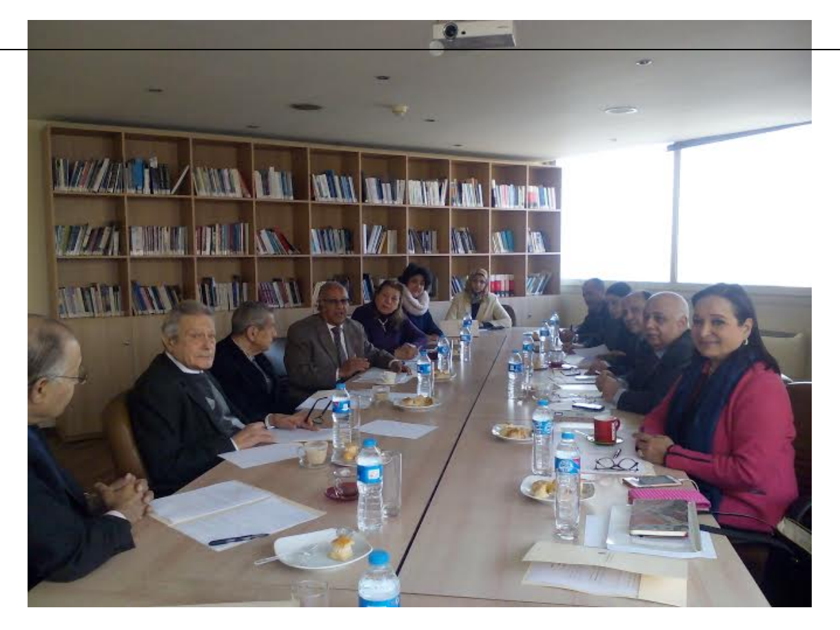
Egyptian Council for Foreign Affairs. Cairo, Egypt. 28 January 2016.