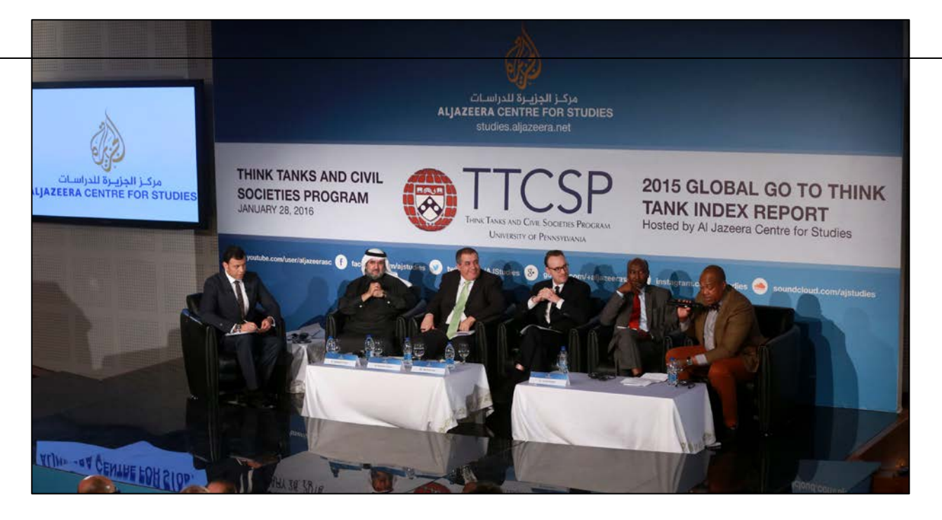
Al Jazeera Centre for Studies. Doha, Qatar. 28 January 2016.